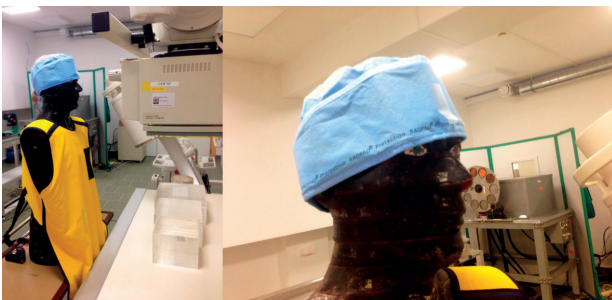
Figure 2. The geometry of the measuring system in the laboratory

being performed by the physician working in the second center. In total, 14 measurements were performed including doses from 291 procedures. Moreover, only 3 dosimeters outside and inside the lead free cap were attached in the regions of the highest exposure as determined during the first phase: on the left temple, on the left eyebrow and on the forehead between the eyes (Figure 1).