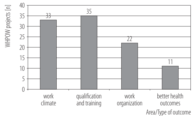
Fig. 1. Thematic area of the workplace health promotion for older workers (WHPOW) programs

Most of the WHPOW programs targeting a single area of interest aimed at maintaining “lifelong learning” for older workers, and at promoting their qualification and training (18 studies). Many of these projects focused on enhancing an intergenerational transfer of knowledge, experience, ideas and skills from older to younger workers. Other programs were devoted to promoting the employment of older workers and to increasing job retention among pre-retirement workers. The second most frequent type of activity (10 studies) dealt exclusively with improving the work climate and attitudes toward older workers. The main topics of these projects were: development of a policy for older workers aimed at preventing early retirement, fighting discrimination and exclusion and reducing the gender gap. Two projects concerned the promotion of better health outcomes for older workers by means of medical assistance for general health checks. These projects were designed mainly to promote lifestyle change and prevent cardiovascular or other chronic diseases, but also to improve the physical work environment and pro-