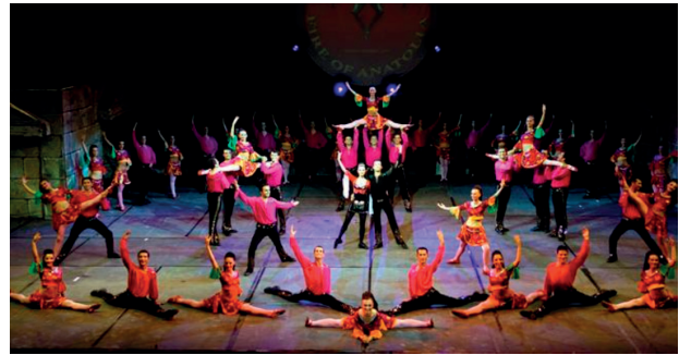
Figure 3. The split figure in the Karsilama dance

Patellar dislocation occurs after twisting the knee due to the valgus stress when the foot is on the ground, right before initiating a turn or jump in the air. The required torque is attained by stepping the “standing” foot on the ground; the leg is rotated according to both the foot and the thigh, and then it is angulated. The rotation and angulation of the leg in respect to the foot and the hip is increased. Several predisposing factors, including femoral trochlear dysplasia, patella alta, and lateralization of the tibial tuberosity, contribute to patellar instability and lat-