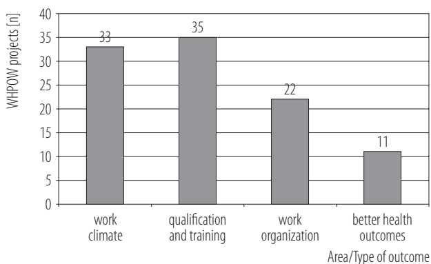
Fig. 1. Thematic area of the workplace health promotion for older workers (WHPOW) programs

Most of the WHPOW programs targeting a single area of interest aimed at maintaining “lifelong learning” for older workers, and at promoting their qualification and training (18 studies). Many of these projects focused on enhancing an intergenerational transfer of knowledge, experience, ideas and skills from older to younger workers. Other programs were devoted to promoting the employment of older workers and to increasing job retention